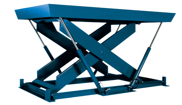
15,000 lb. Capacity - 7 x 10 ft. Platform

Capacity: 15,000 lbs. Platform Size: 7 x 10 ft. Max. End: 15,000 lbs. Loading Sides: 15,000 lbs. Travel: 58 in. Lowered Height: 16.5 in. Raised Height: 74.5 in. Approx. Speed Up: 41 sec. External Motor: 5 HP Shipping Weight: 5,700 lbs.