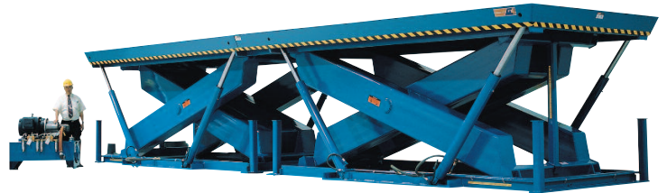
20,000 lb. Capacity - 6 x 22 ft. Platform

Capacity: 20,000 lbs. Platform Size: 6 x 22 ft. Max. End: 15,000 lbs. Loading Sides: 30,000 lbs. Travel: 58 in. Lowered Height: 16.5 in. Raised Height: 74.5 in. Approx. Speed Up: 76 sec. External Motor: 7.5 HP Shipping Weight: 11,600 lbs.