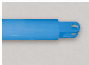
▶ Machine Grade Cylinder