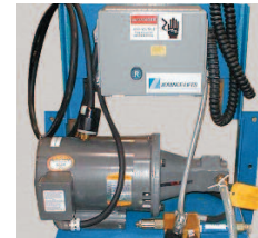
▶ Power Unit