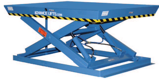
5,000 lb. Capacity - 7 x 8 ft. Platform

Capacity: 5,000 lbs. Platform Size: 7 x 8 ft. Max. End: 3,500 lbs. Loading Sides: 3,500 lbs. Travel: 58 in. Lowered Height: 10 in. Raised Height: 68 in. Approx. Speed Up: 25 sec. External Motor: 5 HP Shipping Weight: 2,370 lbs.