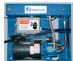
▶ Power Unit