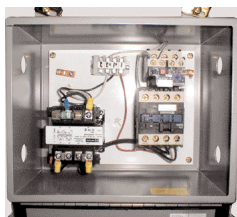
▶ UL Listed Control Panel