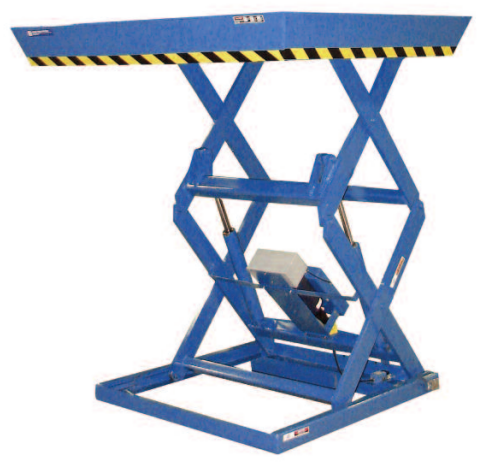
6,000 lb. Capacity - 48" in. Travel