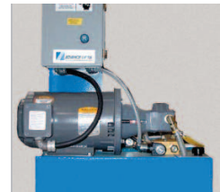
▶ Power Unit