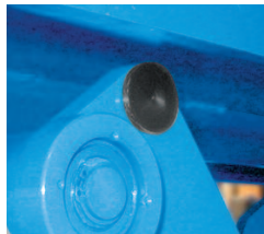
▶ Platform Centering Device