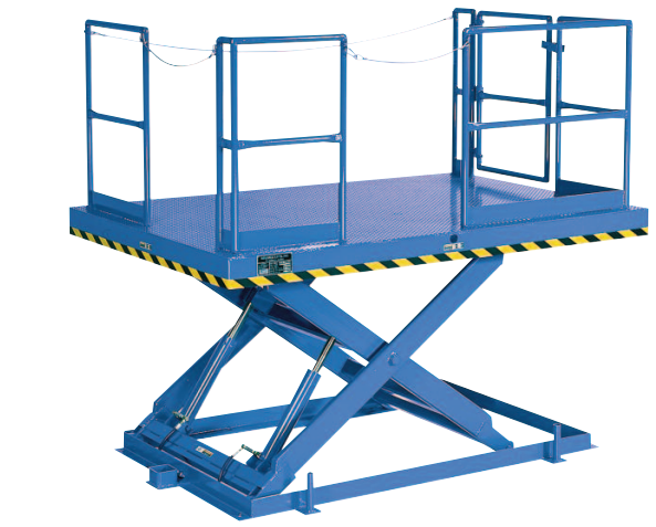
2,000 lb. Capacity - 72" in. Travel

Capacity: 2,000 lbs. Min. Platform Size: 48 x 96 in. Max. Platform Size: 96 x 144 in. Travel: 60 in. Lowered Height: 10 in. Raised Height: 70 in. Approx. Speed Up: 20 sec. External Motor: 5 HP Shipping Weight: 2,100 lbs.