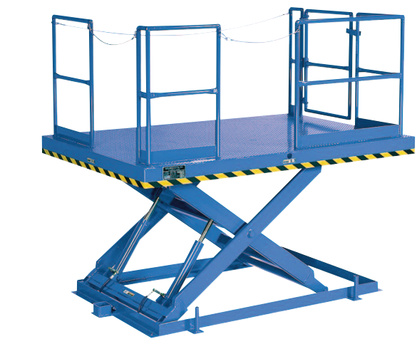
2,000 lb. Capacity - 72" in. Travel

Capacity: 2,000 lbs. Min. Platform Size: 48 x 102 in. Max. Platform Size: 96 x 168 in. Travel: 72 in. Lowered Height: 8 in. Raised Height: 80 in. Approx. Speed Up: 24 sec. External Motor: 5 HP Shipping Weight: 2,700 lbs.