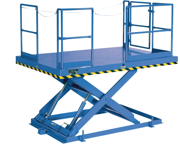
2,000 lb. Capacity - 60" in. Travel

Capacity: 2,000 lbs. Min. Platform Size: 48 x 96 in. Max. Platform Size: 96 x 144 in. Travel: 60 in. Lowered Height: 10 in. Raised Height: 70 in. Approx. Speed Up: 20 sec. External Motor: 5 HP Shipping Weight: 2,100 lbs.