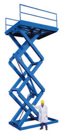
6,000 lb. Capacity - 120 in. Travel