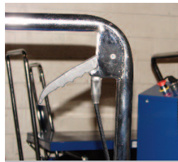
▶ Easy Hand Release