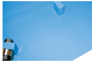
▶ Hard stop