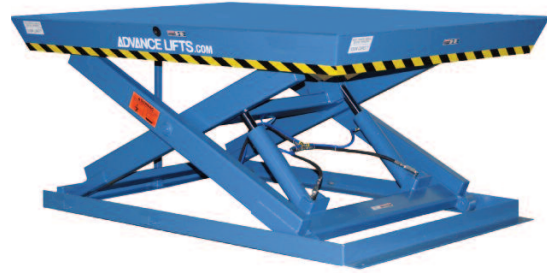
5,000 lb. Capacity - 8 x 9 ft. Platform

Capacity: 5,000 lbs. Platform Size: 8 x 9 ft. Max. End: 3,500 lbs. Loading Sides: 3,500 lbs. Travel: 58 in. Lowered Height: 10 in. Raised Height: 68 in. Approx. Speed Up: 25 sec. External Motor: 5 HP Shipping Weight: 2,610 lbs.