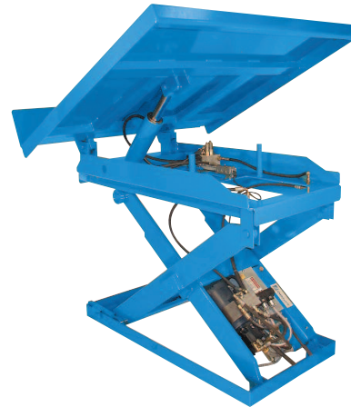
5,000 lb. Capacity - 48 in. Travel

These lift and tilt units are optimized combination designs that are used where the lifting and tilting functions must be done independently.