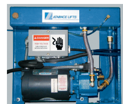
▶ Power Unit