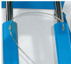
▶ MSL Cylinder w/Clear Plastic Return Lines