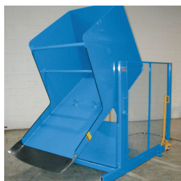
▶ Optional Chutes & Soft Lips.