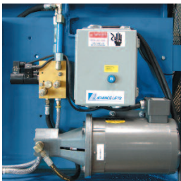
▶ Continuous Duty Power Units.