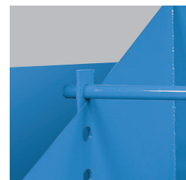
▶ Adjustable Retaining Bar.