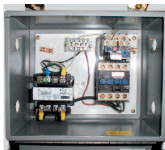
▶ UL Listed Control Panel