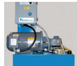
▶ Power Unit