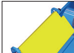
▶ Hinged Maintenance Device