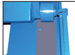
▶ Replaceable Roller Wear Strip