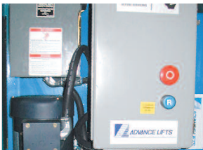
▶ Standard power unit