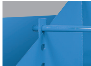
▶ Adjustable retaining bar