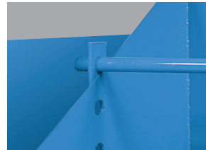
▶ Adjustable retaining bar