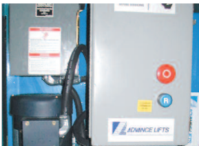
▶ Standard power unit