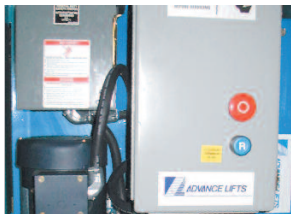
▶ Standard power unit