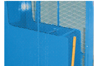
▶ Standard mesh guard