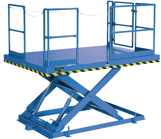
2,000 lb. Capacity - 72" in. Travel

Capacity: 2,000 lbs. Min. Platform Size: 48 x 102 in. Max. Platform Size: 96 x 168 in. Travel: 72 in. Lowered Height: 8 in. Raised Height: 80 in. Approx. Speed Up: 24 sec. External Motor: 5 HP Shipping Weight: 2,700 lbs.