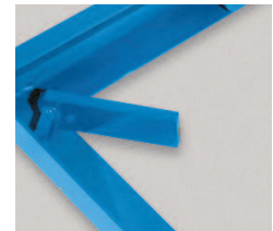
▶ BFL Swing Arm Safety Bar