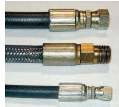
▶ Double Wire Braid Hose