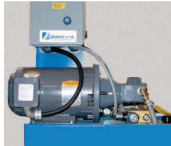
▶ Power Unit w/Controller