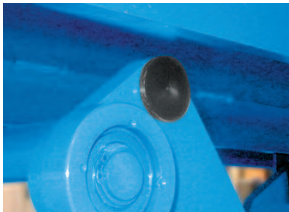
▶ Platform Centering Device