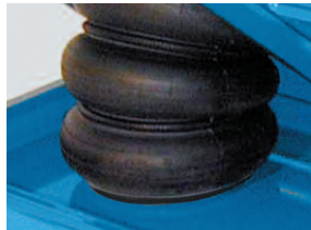
▶ Air Spring