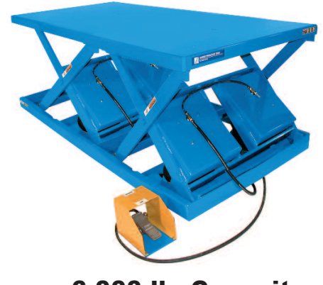
6,000 lb. Capacity

Min. Platform Size: 36 x 96 in. Max. Platform Size: 60 x 144 in. Max. End Capacity: 1,000 lbs. Loading Side Capacity: 1,000 lbs. Baseframe Size: 36 x 96 in. Lowered Height: 9 in. Travel: 24 in. Raised Height: 33 in. Shipping Weight: 1,500 lbs.