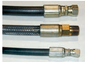
▶ Double Wire Braid Hose