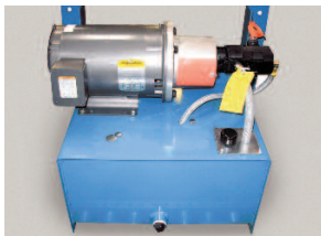
▶ Power Unit