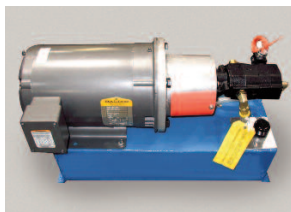
▶ Power Unit