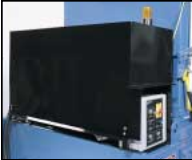
Optional weatherproof power unit cover (shown without electrical panel cover).