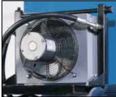
Optional heat exchanger.