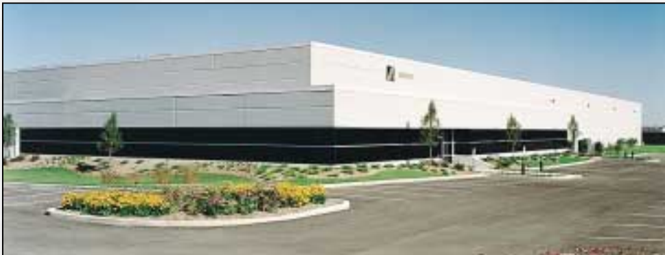
Advance's state-of-the-art, 120,000 square foot building houses all operations including sales, design, manufacturing and shipping.

VALUE - It's very simple. Advance distributors save you money by applying the right equipment to the job, making sure it's installed correctly, and making sure you get service when you need it. Call your Advance distributor to insure your project's success.